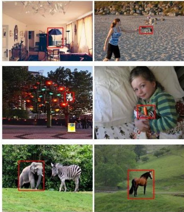
Painted out-of-context (top 2 rows) and in-context (bottom row) objects.

How do we teach context at scale when contextual violations are inherently uncommon?